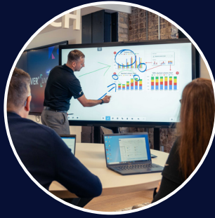
Enhanced Boardroom Collaboration