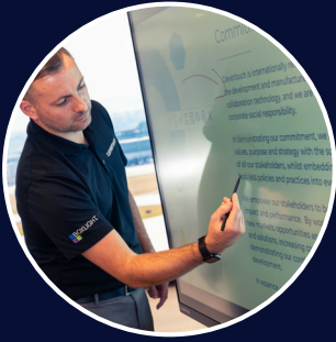
Collaboration Tools at your fingertips